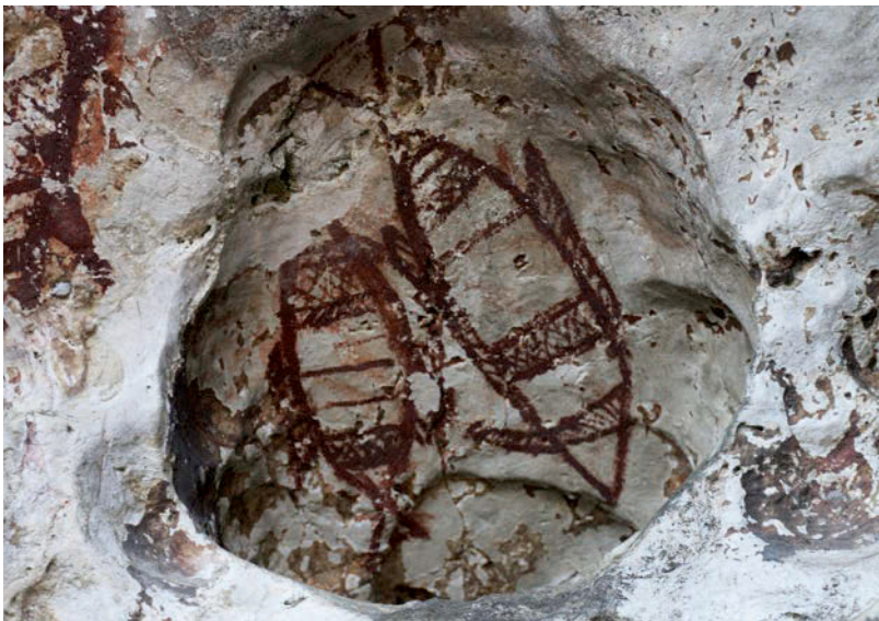
Left, below: Two fish at Leang Lasitae, and bottom: Drawing of a abirusa (deer-pig) at Leang Pettakere