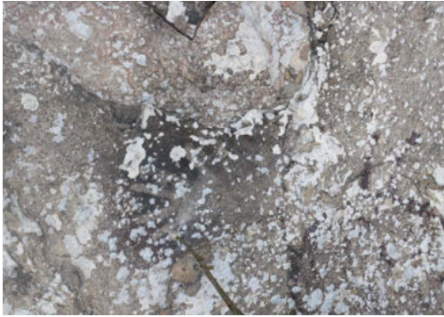
Previous pages: Hands and anoa from Leang Sakapao